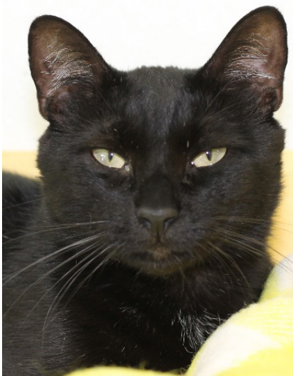
Dustin, available for adoption.