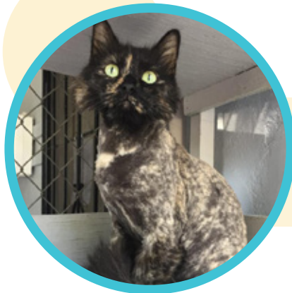
"Scarlett" assisted in grooming, starting with her own summer cut