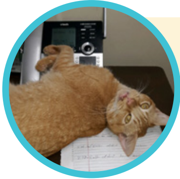
"Kit" helped with the phone