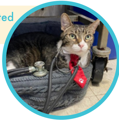
"Bailey" assisted the vet techs