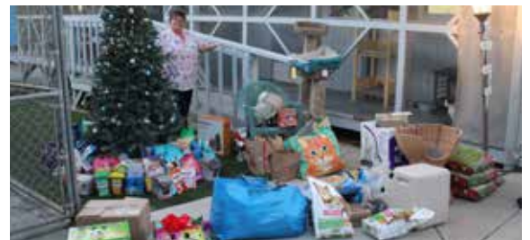
Whisker Wonderland Generous Gifts

We ended 2022 with the "Whisker Wonderland" event at the shelter. After 2 years, this event returned with an amazing outpouring of gifts for the cats and over 1,000 cans of cat food. A big thank you to Nothing Bundt Cakes in Santee and Mary's Donuts for contributing refreshments!