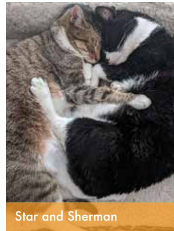
Star and Sherman