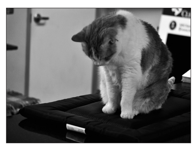
An office cat tests out one of the complimentary cat beds given to adopters courtesy of the Helen Woodward Animal Center.