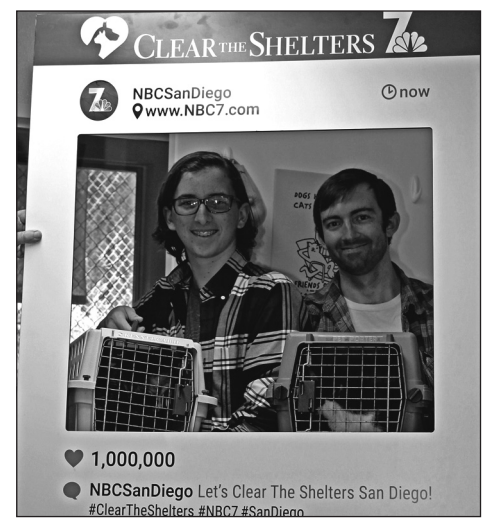
Bonded buddies Annie and Chip with new family.