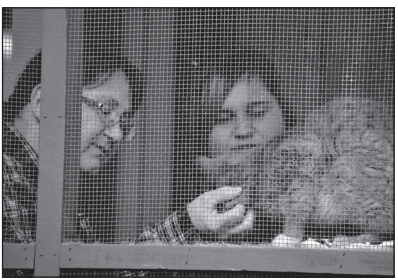
Cinco de Meow attendees enjoyed a full day of fun—shopping at our Kitty Boutique, sampling great Mexican fare, touring the Shelter, and enjoying the company of our many cats.