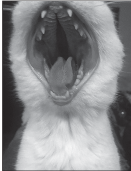
The extent of Poe's cleft deformity can be seen in this photo.