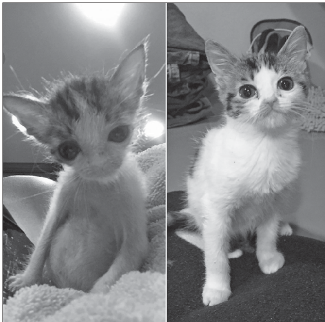
Poe as a kitten in summer (left) and fall of 2015