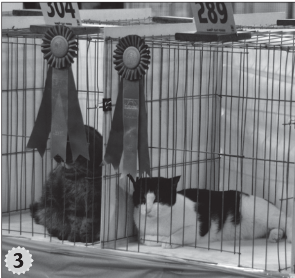
. . . by netting his best award yet—a rosette for 6th Best Cat in the Household Pet division!